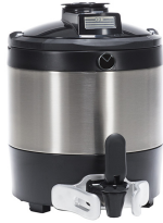
TF SERVER, 1G DSG GEN3 NOBASE