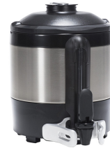
TF SERVER, 1G MECH GEN3 NOBASE