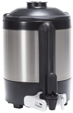
TF SERVER, 1.5G MECH NOBASE GEN3