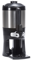
TF SERVER, 1.5G MECH GEN3