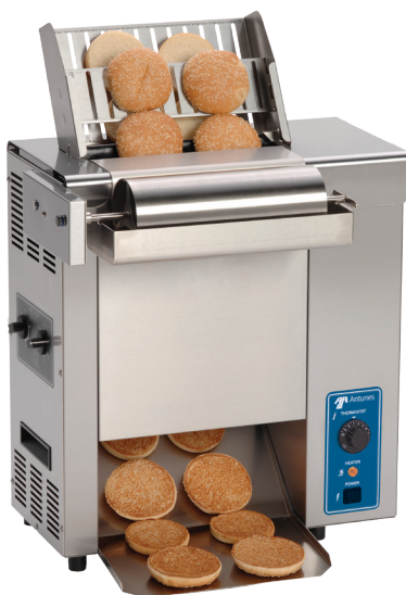
VCT-1000 Vertical Contact Toaster

The Vertical Contact Toaster gives buns a consistent, golden brown finish which helps the sandwich stay firm and delicious. The VCT-1000 has a preset features a dial thermostat for adjusting the quality of the toast for a variety of different bread products. Available preset toast times range from 10 seconds to 28 seconds to keep up with the demand of any sized operation.