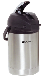
AIRPOT, 2.5L SST LA SINGLE PK