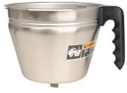
FUNNEL ASSY, W/ INSERTS SMTF