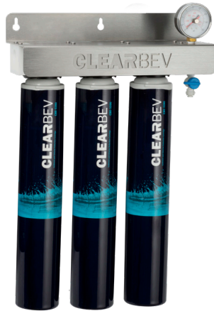
CBE-TR with three CBE-3200 cartridges