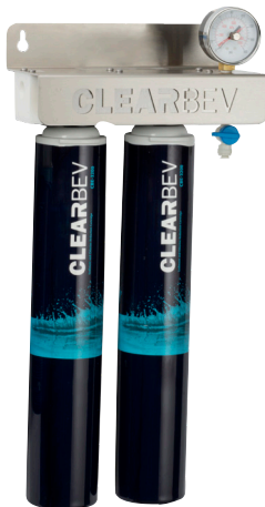
CBE-TW with two CBE-3200 cartridges

Experience a new freedom in foodservice water treatment with ClearBev, an economical solution to filtration does not compromise on quality or performance. The CBE series of systems is interchangeable with the legacy Everpure® products while meeting or exceeding their performance standards.