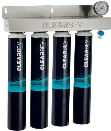
CBE-QD with four CBE-3200 cartridges