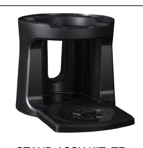
STAND ASSY KIT, TF SERVER