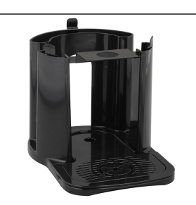
STAND ASSY, TF SERVER