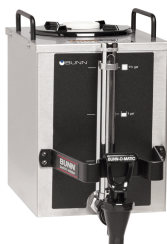
1.5GPR-FF, TOP HNDL