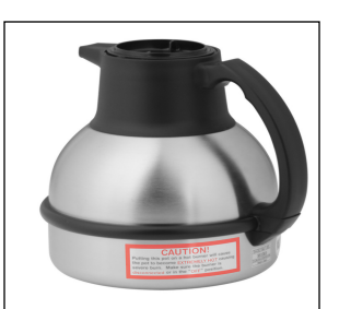
THERMAL CARAFE,ORN 1.9L 12PK