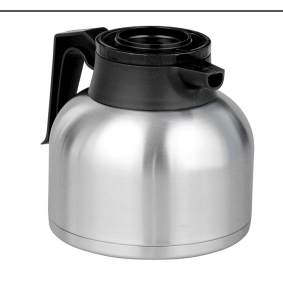
CARAFE,SST 1.9L SHRT BLK 1