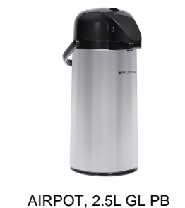
AIRPOT, 2.5L GL PB SINGLE PK