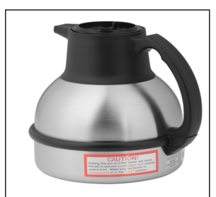
THERMAL CARAFE, BLK 1.83 L 1PK