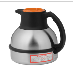
THERMAL CARAFE,ORN 1.9L 1PK