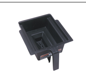
FUNNEL W/DECAL,PPK NAR BLK(LG)