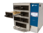
IS-7000 7- DRAWER STEAMER