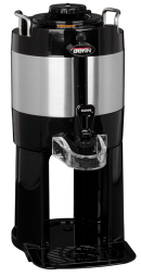
TF SERVER, 1G/3.8L MECH