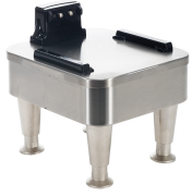
1SH STAND, CE 220-240V INF SERIES