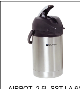
AIRPOT, 2.5L SST LA 6/ CASE