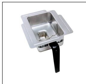
FUNNEL ASSY, SST-PP BLK HNDL