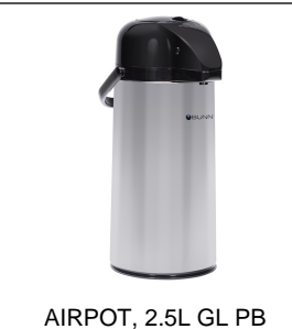
AIRPOT, 2.5L GL PB SINGLE PK