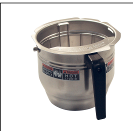
FUNNEL AY,W/DECAL GRT "C"7.12