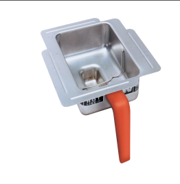
FUNNEL ASSY,SST-PP ORANGE HDL