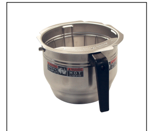
FUNNEL AY,W/DECAL GRT "C"7.62