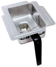
FUNNEL ASSY, SST-PP BLK HDL