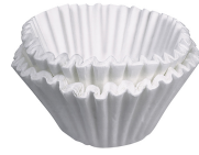
FILTERS,REGULAR1M 500/2 50/CL