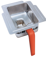
FUNNEL ASSY,SST-PP ORANGE HDL