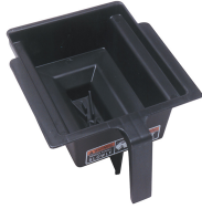
FUNNEL W/DECAL,PPK NAR BLK(LG)