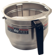
FUNNEL AY,W/DECAL GRT "C"7.62