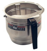
FUNNEL AY,W/DECAL GRT "C"7.12