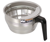
FUNNEL ASSY, SST-BLK HDL(7.12)