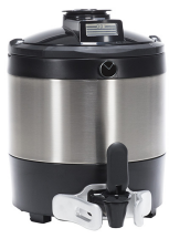
TF SERVER, 1G DSG GEN3 NOBASE