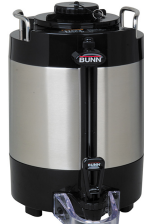
TF SERVER, 1.5G/5.7L MECH NOBASE