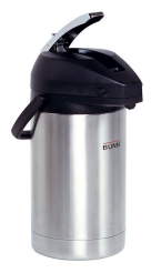
AIRPOT, 3.0L SST LA SINGLE PK