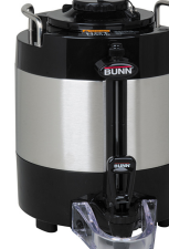
TF SERVER, 1G/3.8L MECH NOBASE