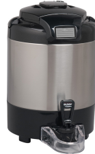
TF SERVER, DSG2 1.5G SST NOBAS