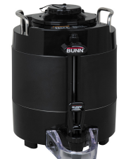
TF SERVER, 1G/3.8L MECH BLK NOBASE