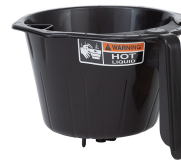
FUNNEL ASSY, SMART COFFEE BLK-CLEARED