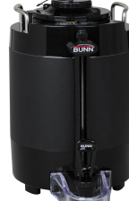
TF SERVER, 1.5G/5.7L MECH BLK NOBASE