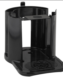
STAND ASSY, TF SERVER