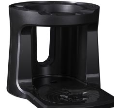
STAND ASSY KIT, TF SERVER