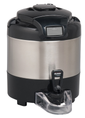
TF SERVER, DSG2 1G SST NOBASE