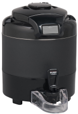
TF SERVER, DSG2 1G BLK NOBASE