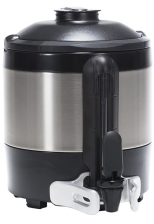
TF SERVER, 1G MECH GEN3 NOBASE